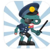
Math Vs Zombies Free (iOS) Free (Google)