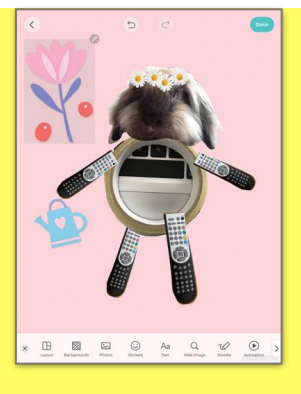
Finally add some stickers and animations to finish it off!