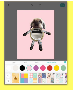
To add a background at the bottom there is a tool bar, select 'background' and then choose one you like.