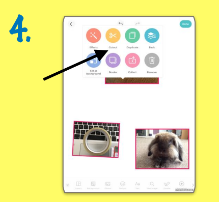
Double tap on each image in turn. Select the CUTOUT button and trim the image.

Tap anywhere on the screen and select 'photos' from the menu. Then select your photos and press the tick to add them to your collage.