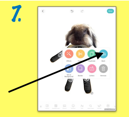
Choose which images will overlap and which will go 'behind' by using the FRONT and BACK button.